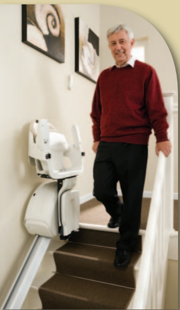
Folds away neatly

ENQUIRIES: 01642 768590 SERVICE: 01642 763646 FAX: 01642 766590